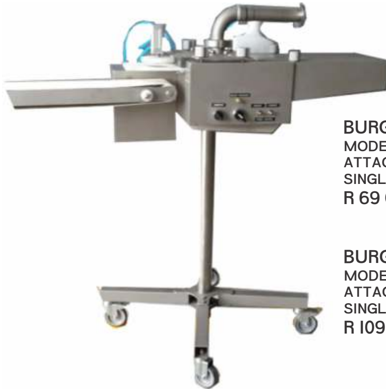
BURGER FORMER MODEL PMA 40 P ATTACHMENT FOR PISTON FILLER SINGLE PATTY R 69 000.00