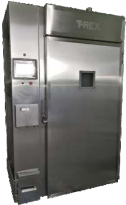
Sc2500 ECO SINGLE TROLLEY INC. 1 TROLLEY R 325 000.00