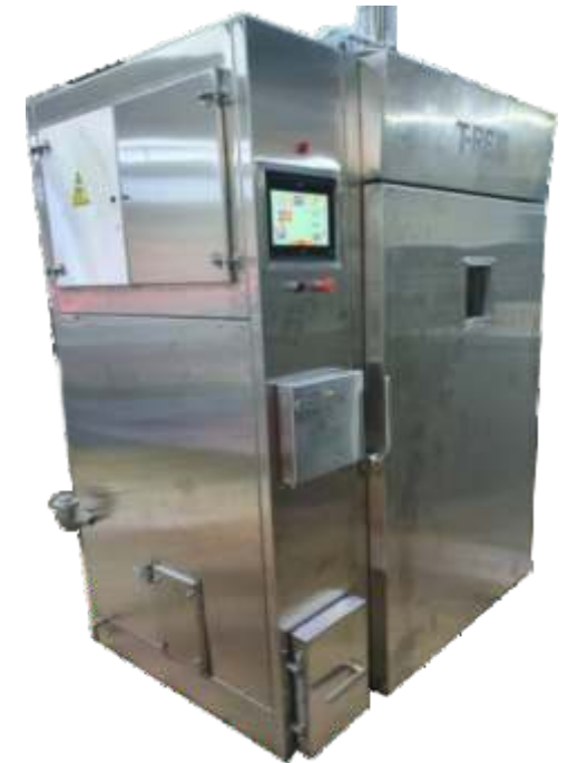
SC2500 ECO (MEDIUM SIZE) INC. 1 TROLLEY R 240 000.00