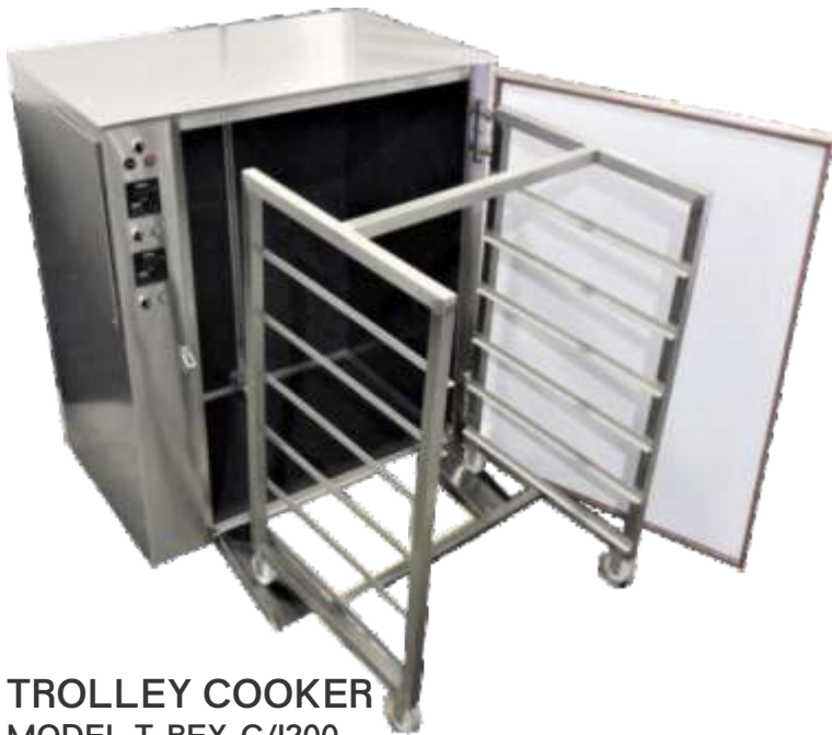
TROLLEY COOKER MODEL T-REX-C/I200 R69 999

TROLLEY COOKER WITH COMBINED GAS ELECTRIC OPTION FOR LOADSHEDDING R 129 999.00