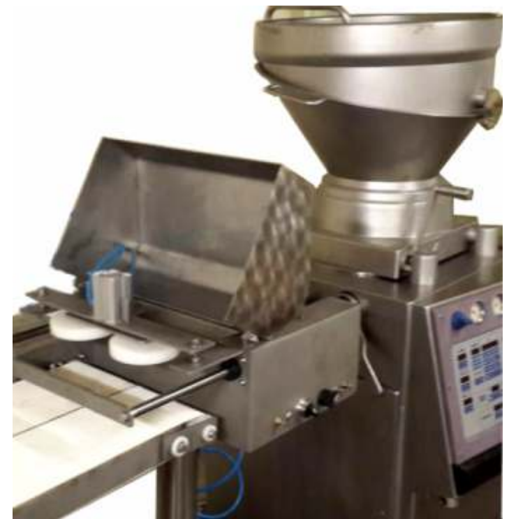
BURGER FORMER MODEL PM 80V DOUBLE FORMER FOR VACUUM FILLER R 189 000.00