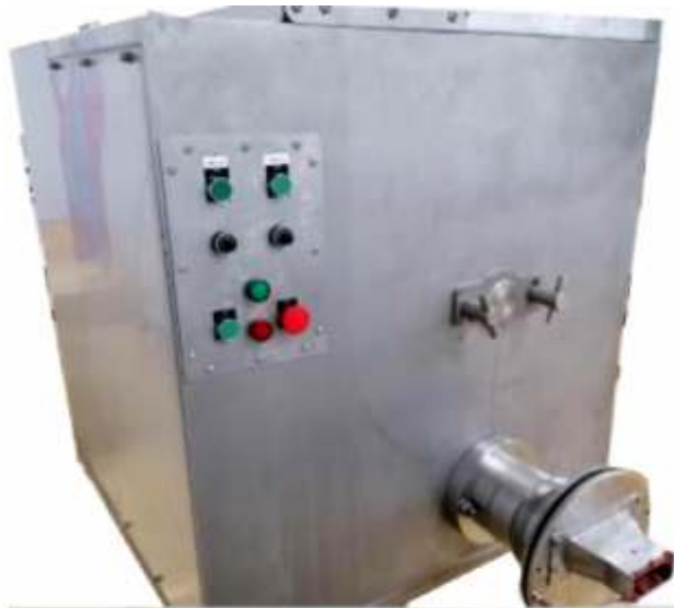
T REX 52 MIXER/MINCER

52 MIXER/MINCER I50I MODEL M/MI50 R 169 000.00