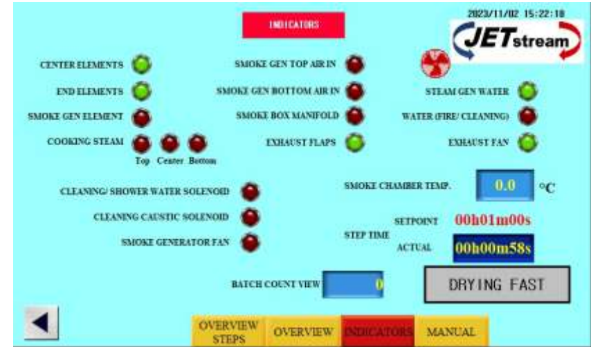
PROGRAM INDICATORS SCREEN

EASY STEP CONTROL UPGRADE TO WI-FI, BATCH AND LOGS TRACKING, ECT. > SMART TECHNOLOGY