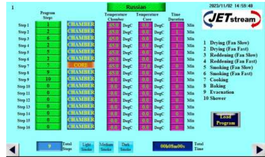
PROGRAM SETTING SCREEN