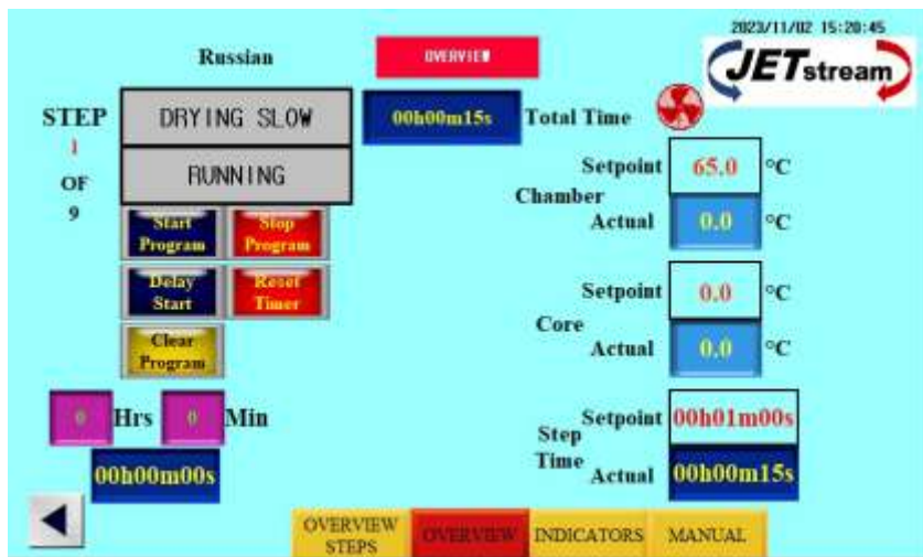
PROGRAM OVERVIEW SCREEN