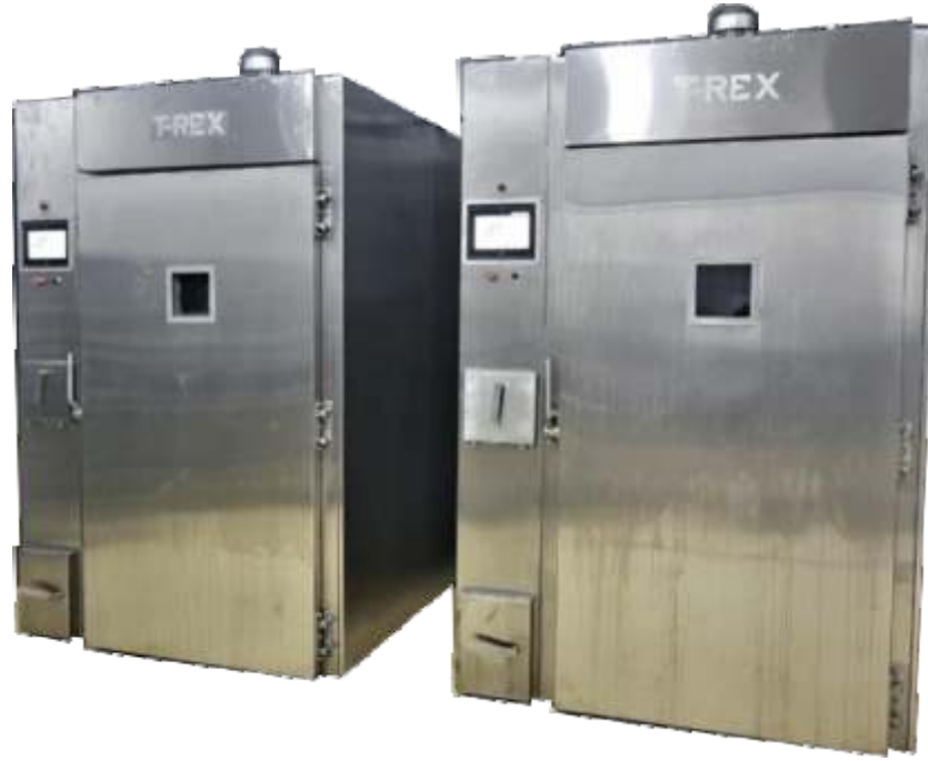
SC2500 ECO DOUBLE TROLLEY INC. 2 TROLLEY R 495 000.00